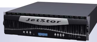
JetStor SAS 516iS